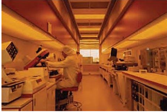
FIGURE 4: Fabrication processing line at HP's ICPL.

Conway next fashioned an even more ambitious multi-university program—MPC79. The first session of AMW6 featured her bold initiative as “Special Purpose Building Blocks,” chaired Wednesday April 23, 1980 by Carlo Séquin, described by Carver Mead, Jim Clark, Glenn Krasner and Dick Lyon. The MPC79 chip set contained 82 design projects from 124 designers at 12 universities, spread across 12 die-types on two wafer sets. Astoundingly, turnaround time from design cutoff to distribution of packaged chips was only 29 days, again using Hewlett-Packard's Palo Alto research fabrication facility. Conway's proud assessment: “We'd done the impossible: demonstrating that system designers could work directly in VLSI and quickly obtain prototypes at a cost in time and money equivalent to using off-the-shelf TTL” [14].