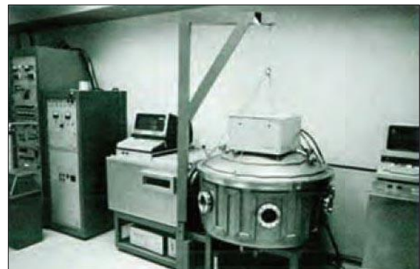
FIGURE 3: Computer-controlled plasma system at HP’s ICPL.